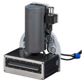
2022-V with optional mounting bracket